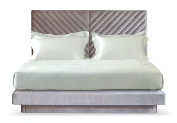
Upholstered in Pierre Frey Teddy Mohair fabric in 'Perle' N^{\circ}4