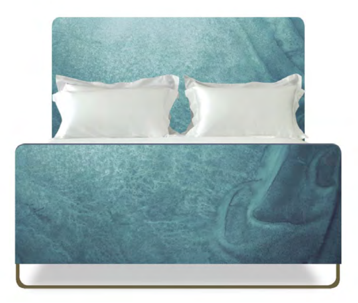
Upholstered in Bill Amberg 'Ocean' leather Curved brass detailing on headboard and footboard in a satin finish $\mathrm{N}^{\circ}3$

Designed by leather specialist Bill Amberg, Ocean is inspired by the the refraction of light breaking through the water during the early morning hours. The digitally printed leather, developed exclusively for Savoir, is complemented by a solid brass frame creating a contemporary silhouette.